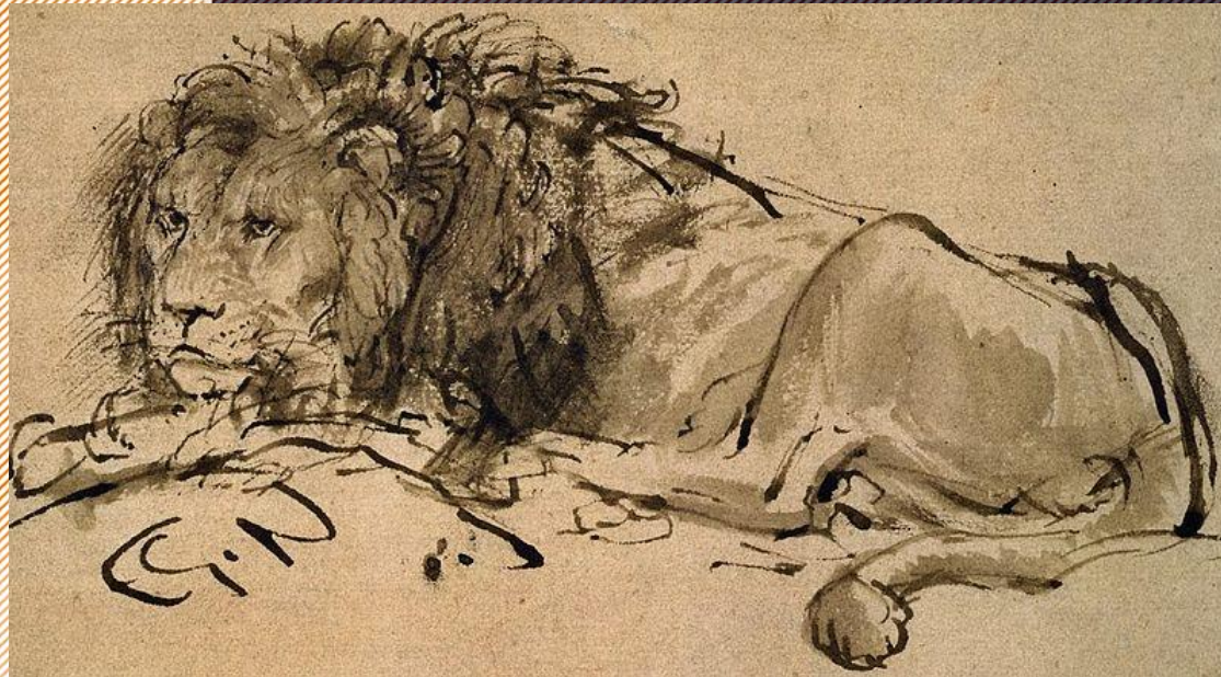
Lion Lying Down. Rembrandt 1650. Pen and ink wash